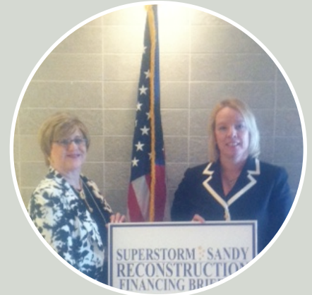
Capitol Hill, Washington DC January 23, 2013 (Sandy/ Financing Briefing)

"The Eco Commerce Center for Innovation"